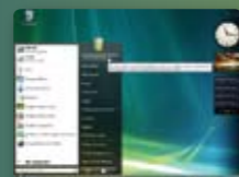
Windows Vista desktop