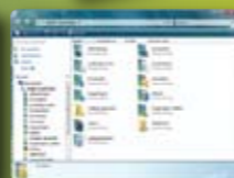
The updated Folder window